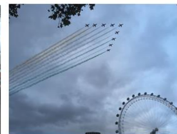
Yr5 /6 Visit to Houses of Parliament and London (during the state visit of India's Prime Minister) November 2015 Explored values of Justice, Honesty and Truthfulness