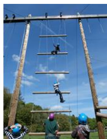
Values: Courage and Teamwork