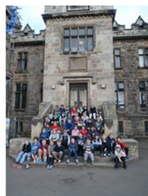
Ford Castle June 2015