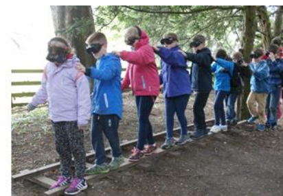
Developing Trust (Value)